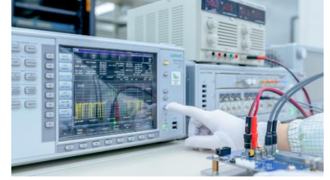
Power and Wavelength Testing