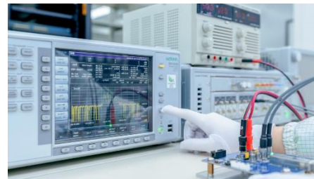
Power and Wavelength Testing

Thank you customers for trusting and supporting us during the past time, we hope to continue to serve you in the future.!