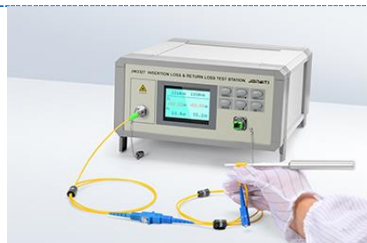
Return Loss Testing

Thank you customers for trusting and supporting us during the past time, we hope to continue to serve you in the future.!