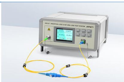
Insertion Loss Testing