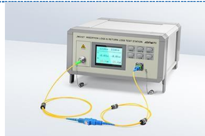
Insertion Loss Testing