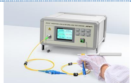
Return Loss Testing